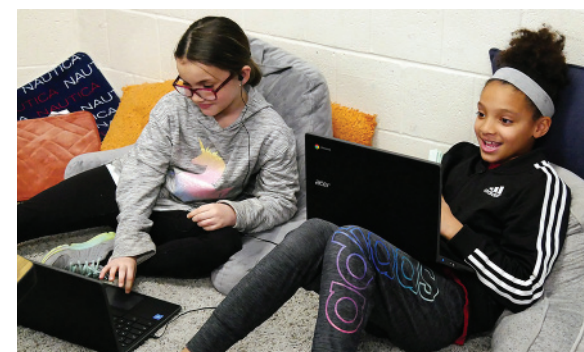
Students at Kennedy Elementary School, Wellington USD 353, used computers to work at their own pace, and many classrooms have flexible seating areas.