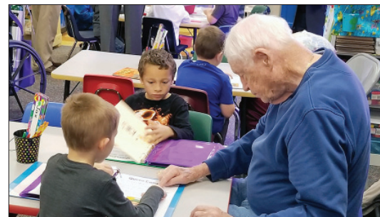
The Age-to-Age program at Windsor Place Nursing Home is a partnership between Coffeyville USD 445 and Windsor Place Nursing Home that began in 2008. The intergenerational environment pairs kindergarten students with residents, also known as "grandmas and grandpas," who have years of life experience to share. Students read to the residents and vice versa.

Kansas State Department of Education (KSDE) leaders, along with Kansas State Board of Education members, conducted more than 20 community conversations with teachers, parents, business leaders and community members across the state before setting a new vision for education. Kansans said academic skills are important, but so are nonacademic skills, such as critical thinking, teamwork, perseverance and civic engagement. Kansans also said we need to move away from a "one-size-fits-all" system that relies exclusively on state assessments to measure student success. The new, student-focused system will provide support and resources for individualized success.