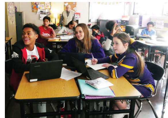
A social-emotional focus at Coffeyville USD 445 has changed the culture of the district, drastically reducing discipline issues across the district and helping students manage their emotions.

For more information about the Kansans Can School Redesign Project, visit www.ksde.org .