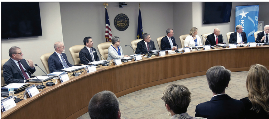
The Aug. 8, 2017, Kansas State Board of Education meeting marked the announcement of the Mercury 7 districts.

The State Board of Education has identified five key outcomes by which to measure our progress. Those outcomes include: