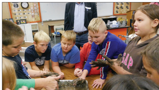
Students at Tescott Grade School, Twin Valley USD 240, studied erosion and weather through project-based learning.

This is the education system Kansas is building through its Kansans Can School Redesign Project.