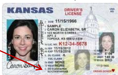
Older Style DL