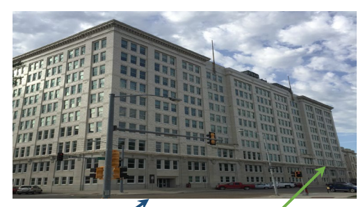
Enter at the <u>north</u> entrance pictured above – 900 SW Jackson Street (corner of 9<sup>th</sup> & SW Jackson)

Doors open to the public at 8 a.m. Take <u>south</u> elevator to 3<sup>rd</sup> floor – Conf. Room 355 South